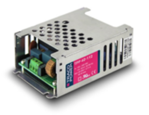
Figure 3: Traco's TPP 40 series is available as both open frame and enclosed

All of the PSUs offer universal mains input (85-264VAC / 120-370VDC) with active power factor correction (PFC) above 100W. The range comprises of single, dual and triple outputs, covering almost all application requirements.