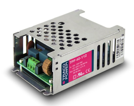
Figure 3: Traco's TPP 40 series is available as both open frame and enclosed

Traco offers both AC/DC and DC/DC solutions for medical applications, all of which fulfil the 2 x MOPP requirement. Compliant with the EMC requirements of IEC 60601-1 (4<sup>th</sup> edition), they are suitable for all patient connected, applied parts medical devices (BF compliant). The AC/DC products range from small 5W PCB-mounting modules, a range of mid-power open frame designs, and enclosed power supplies offering power levels of up to 450W.